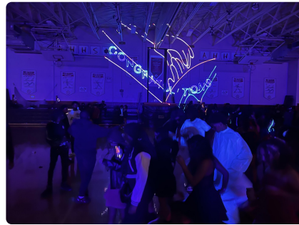
Our Homecoming Dance