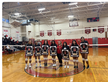
Our Senior Girls Volleyball Players! Congrats on all your success!