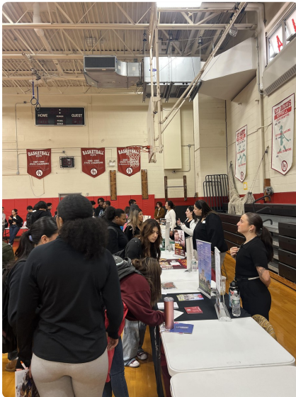
AHHS College Fair

November 23 and 24 - Thanksgiving Recess - School Closed